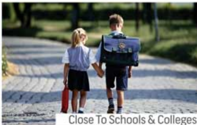
Close To Schools & Colleges